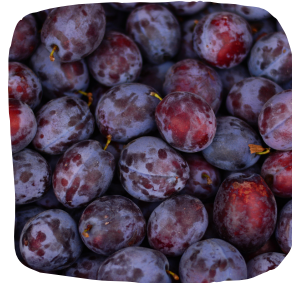
Queen Garnet Plum