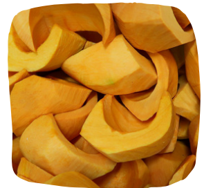
Peeled Japanese Pumpkin