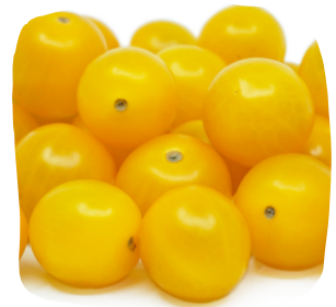
Yellow Grape Tomato