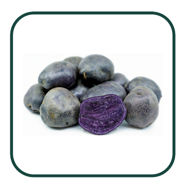
Potato Congo Purple