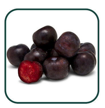
Queen Garnet Plum