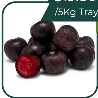
Plum, Queen Garnet