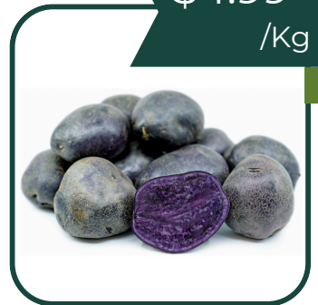
Potato, Congo Purple