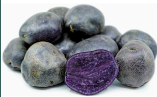
Potato, Congo Purple