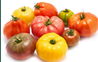
Tomato, Large Heirloom