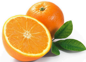
Orange, Mandarin Seedless