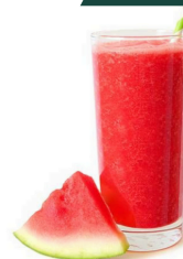
PRS Juice Watermelon, Cold Pressed