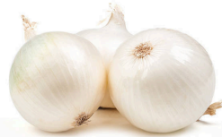
Onion, White Premium